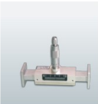
Slide Crew Turner